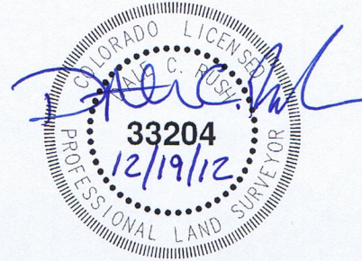
EXHIBIT ATTACHED AND MADE A PART HEREOF.